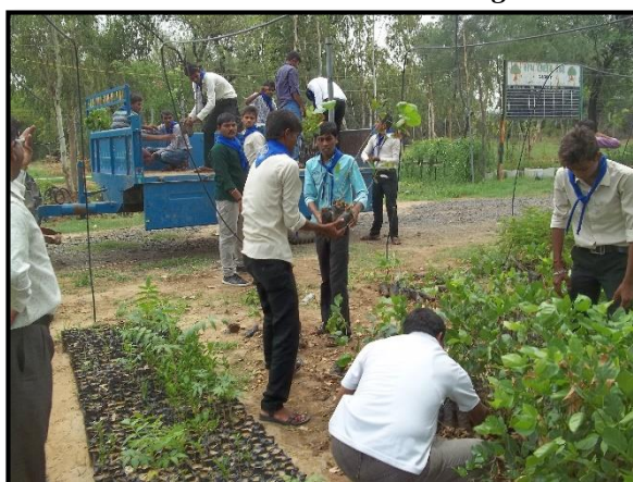
Tree Plantation by NSS Students