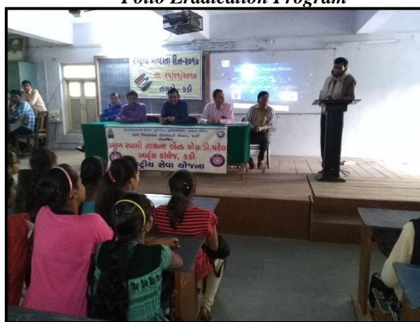
National Voters' Day celebration