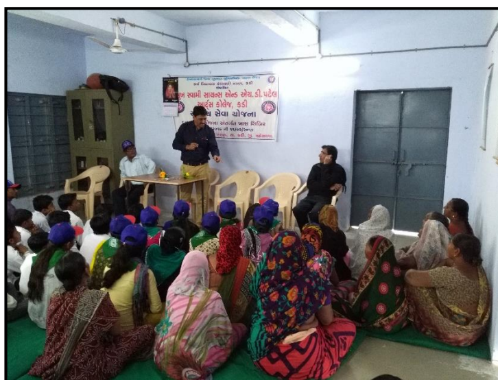
Lecture on Save Girl Child & Grow Girl Child