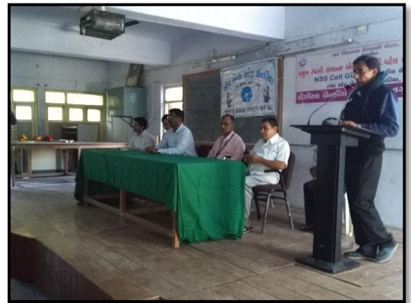
Workshop on Digital Banking