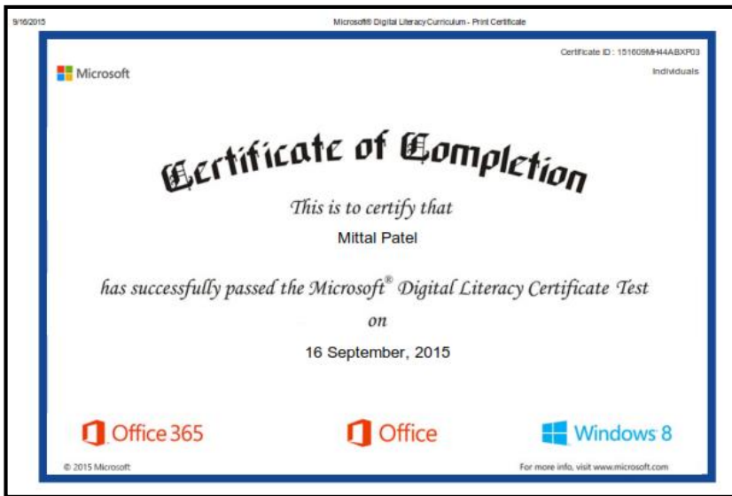
Certificate of a student for Digital Literacy