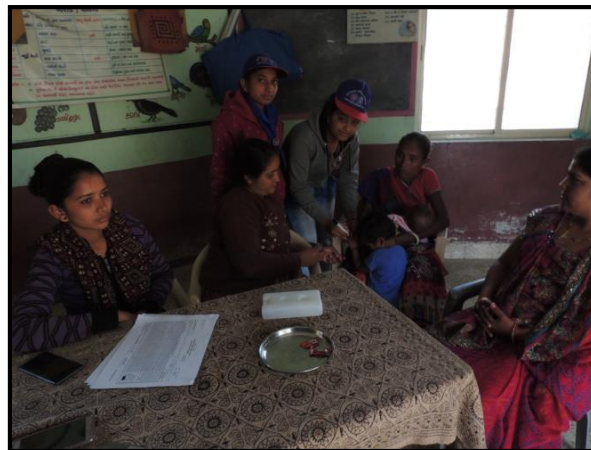
Polio Eradication Program