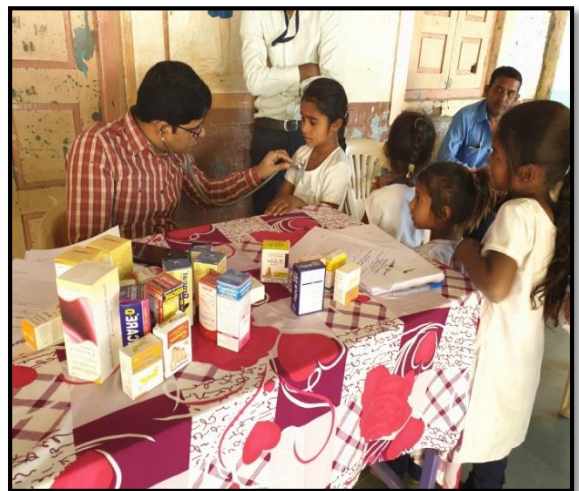
Health Checkup Camp at Laxmipura Village