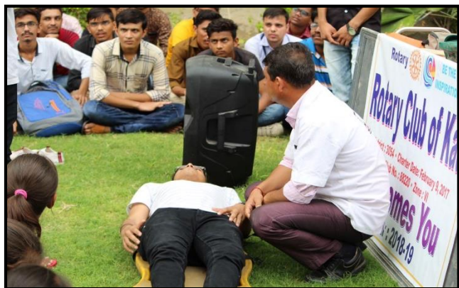
Ambulance Awareness Program