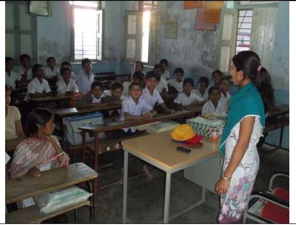
Teaching by NSS Students