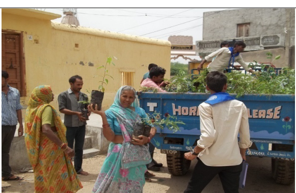
Tree Plant Distribution