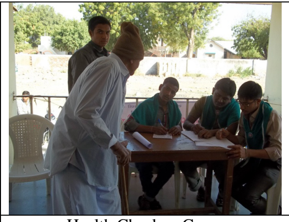
Health Checkup Camp