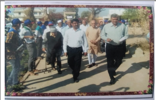
Five no. of PCs Donated to Village School by SVKM