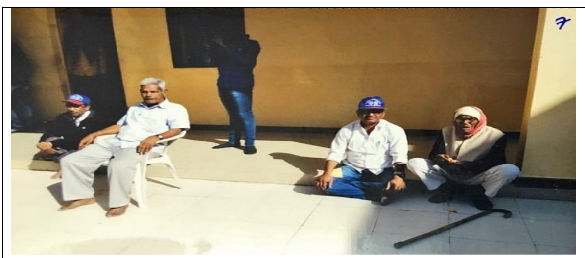
Old Age Home Visit at kalyanpura