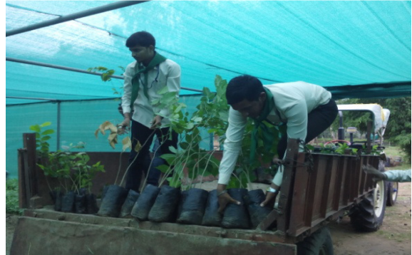
Tree Plant Distribution